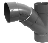
Part No. AW 503C Combination Wye and 1/8 Bend (Two Pieces) (All Hub)