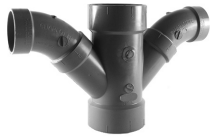
Part No. AW 507C Double Combination Wye and 1/8 Bend, Reducing (Three Pieces) (All Hub)