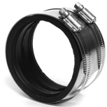
Part No. AW 95C † Transition Coupling - ChemDrain CPVC to Steel, Cast Iron, Plain-end Glass or Any Other Schedule 40 or 80 IPS Size Plastic or Metallic Pipe 300 Series Stainless Steel with Fluoroelastomer Gasket