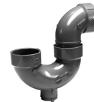
Part No. AW 707XC P-Trap with Solvent Weld Joint & Cleanout (H x H)