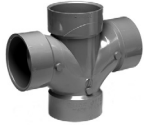
Part No. AW 428C Double Sanitary Tee (All Hub)