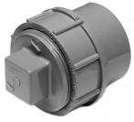
Part No. AW 105XC Fitting Cleanout Adapter with Cleanout Plug (Spigot)