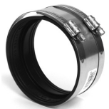
Part No. AW 96C † Transition Coupling - ChemDrain CPVC to Plain-end High-silicon Iron 300 Series Stainless Steel with Fluoroelastomer Gasket