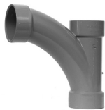
Part No. AW 501C Combination Wye and 1/8 Bend (One Piece) (All Hub)