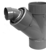
Part No. AW 504C Combination Wye and 1/8 Bend, Reducing (Two Pieces) (All Hub)