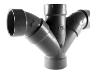
Part No. AW 507C Double Combination Wye and 1/8 Bend (Three Pieces) (All Hub)