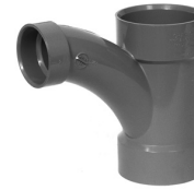
Part No. AW 502C Combination Wye and 1/8 Bend, Reducing (One Piece) (All Hub)