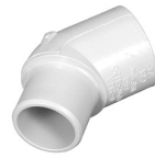
Part No. CTS 2310 Street Elbow 45° (SPG x S)