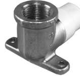
Part No. CTS 2302 L Low-Lead CPVC/Brass Drop Ear Elbow 90° (BRASS FPT x CTS SOCKET)