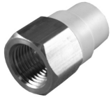
Part No. CTS 2105L Low-Lead Female Adapter, Brass Threads (BRASS FPT x CTS SOCKET)

Note: Different discount may apply to brass items. Please contact sales office.