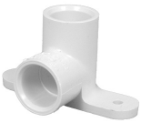
Part No. CTS 2300 D Drop Ear Elbow (ALL-CPVC SOCKET x SOCKET)