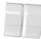
Part No. PVC 115 Adapter Coupling (SDR 35 H x DWV H)