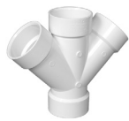
Part No. PVC 611 Double Wye (ALL HUB)