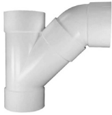
Part No. PVC 503 Combination Wye and 1/8 Bend (Two Pieces, Unassembled) (ALL HUB)