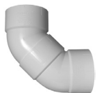
Part No. PVC 300 1/4 Bend (H x H)