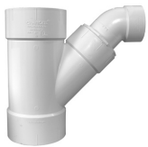
Part No. PVC 504 Combination Wye and 1/8 Bend, Reducing (Two Pieces, Unassembled) (ALL HUB)