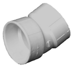
Part No. PVC 324 1/16 Bend (H x H)