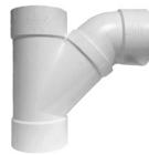
Part No. PVC 400 Sanitary Tee (ALL HUB)