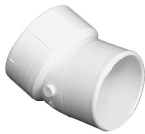
Part No. PVC 326 1/16 Bend, Street (H x SPG)