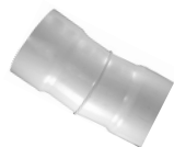
Part No. PVC 328 1/32 Bend (H x H)