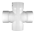
Part No. PVC 410 Tee Cross (ALL HUB)