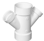
Part No. PVC 612 Double Wye, Reducing (ALL HUB)