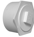
Part No. PVC 108X Flush Bushing (Cleanout Adapter) with Plug (SPG)