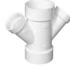
Part No. PVC 612 Double Wye, Reducing (ALL HUB)