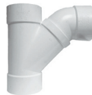
Part No. PVC 400 Sanitary Tee (ALL HUB)