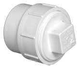
Part No. PVC 105X Fitting Cleanout Adapter with Cleanout Plug (SPG)