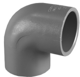
Part No. PVC 8300 90 Degree Elbow (SxS)