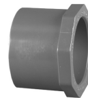
Part No. PVC 8107 Reducer Bushing (Flush Style) (SPG x S)