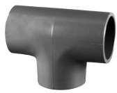
Part No. PVC 8400 Tee (SxSxS)