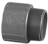
Part No. PVC 8109 Male Adapter [S x MPT]