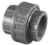
Part No. PVC 8800** Union With Viton® O-Ring Seal (FPT x FPT)