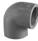
Part No. PVC 8301 90 Degree Elbow (S x FPT)