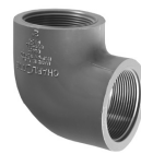
Part No. PVC 8302 90 Degree Elbow (FPT x FPT)