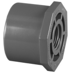
Part No. PVC 8108 Reducer Bushing (Flush Style) (SPG x FPT)