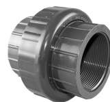
Part No. PVC 8830** Union With EPDM O-Ring Seal (Sx FPT)