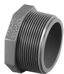
Part No. PVC 8113 Plug (MPT)