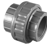
Part No. PVC 8810** Union With EPDM O-Ring Seal (FPT x FPT)