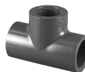
Part No. PVC 8401 Tee [SxSxFPT]