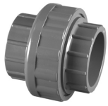
Part No. PVC 8700** Union With Viton® O-Ring Seal (SxS)