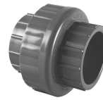
Part No. PVC 8710** Union With EPDM O-Ring Seal (SxS)