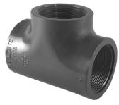
Part No. PVC 8402 Tee (FPT x FPT x FPT)