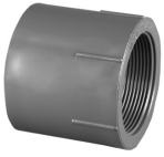
Part No. PVC 8101 Female Adapter [S x FPT]