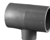
Part No. PVC 8400 Reducing Tee [SxSxS]