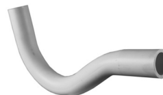
Part No. 2700 Condensate P Trap (SPG x SPG)