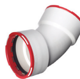
Part No. CTT 321 ConnectTite 1/8 Bend (Hub x Hub)