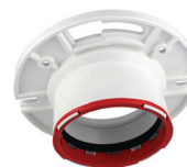
Part No. CTT 800S ConnectTite Closet Flange (Hub)