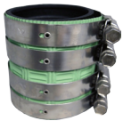
Part No. SDC 4 Heavy Duty (HD) Coupling