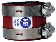
Part No. PGC 1 Pow'r Gear Coupling